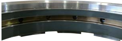
Abradable tertiary seals scheme and stator part

The abradable labyrinth solution is retrofittable with no modification to existing compressor parts. The tertiary contact carbon rings sleeve and housing will be replaced by a toothed sleeve and abradable stator components.