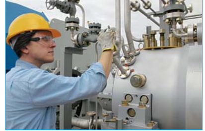
BCL 305C centrifugal compressor