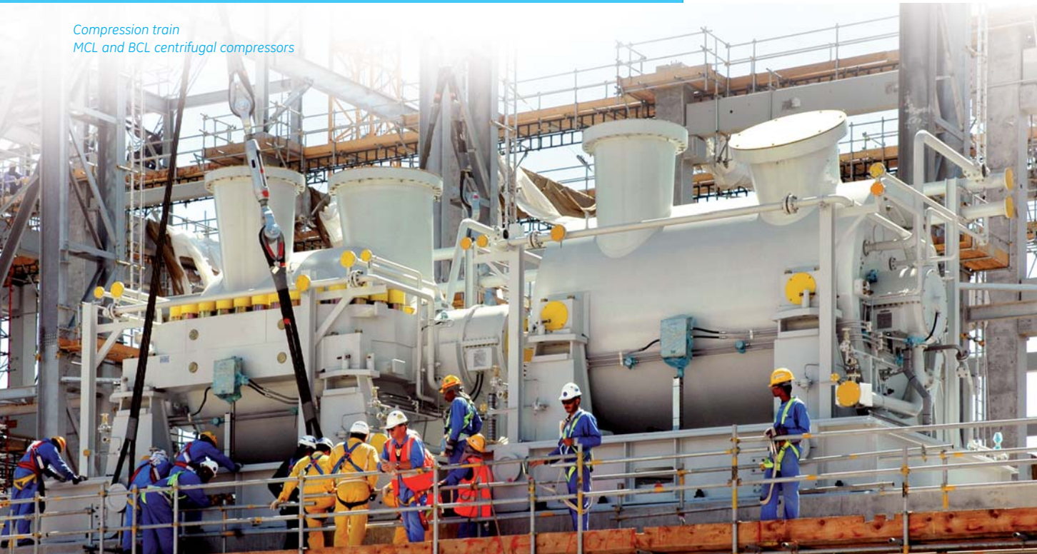
Compression train MCL and BCL centrifugal compressors